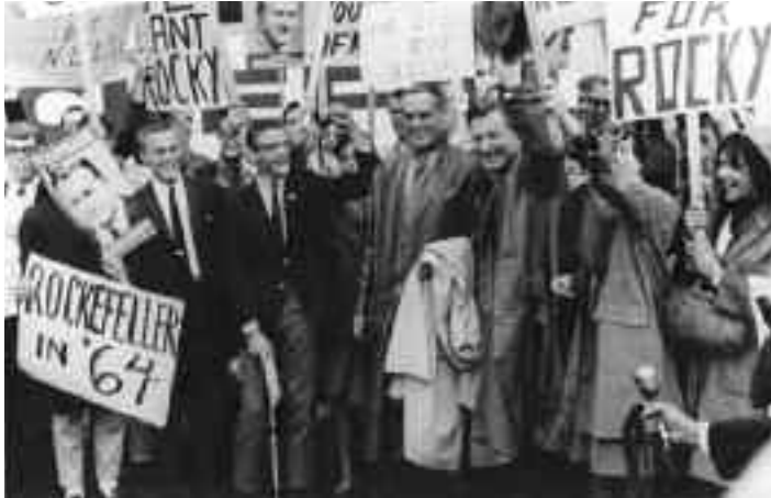
Nelson Rockefeller during a campaign stop at Dartmouth in 1964