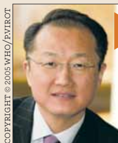
PRESIDENT JIM YONG KIM

President Jim Yong Kim will give an open presentation to the Dartmouth community on "Dartmouth's Financials" on Tuesday, December 1, from 12 to 1:30 p.m. The College is embarking on a strategic budget reduction and investment process to address a structural imbalance in the College's budget. "Our goal will be not just to cut costs, but to improve the way we operate the College in pursuit of its mission," said President Kim in a November 7 letter to the community. (See story on page 1.)