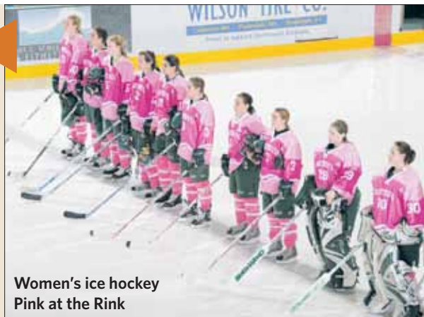
Women's ice hockey Pink at the Rink

Women's Basketball vs. Brown • Friday, February 12 • 7 p.m. • $8 reserved, $6 adult, $3 youth • Leede Arena • 646-2466