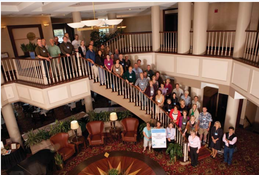
C-MERC participants Workshop 1, Portsmouth, NH September 2010

Two inter-related, invitational workshops (the first of which was held in Portsmouth, NH September 8-10, 2010 and the next in Halifax, NS on July 23, 2011) allow researchers and policymakers to gather and synthesize knowledge about mercury in marine systems, focusing on seven ocean systems and a range of emerging global mercury topics. These meetings are working, roll-up-the-sleeves sessions, not research seminars. Scientists involved with mercury deposition, biogeochemical cycling, trophic transfer, ecotoxicology, and human health related research are connecting with policy stakeholders from EPA, NOAA, FDA, industry and NGOs to examine the implications for human exposure, public health and related issues pertaining to national and global mercury policy.