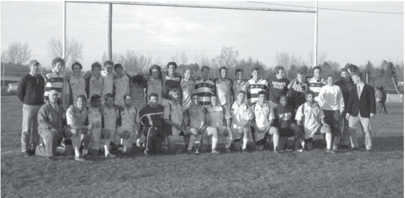
SWEET-SIXTEEN HERE WE COME: The Northeast Championship Runner-up Dartmouth team after their match against Army for the Northeast Championship. The second place finish gives the DRFC the #11 seed in the National Tournament this spring.