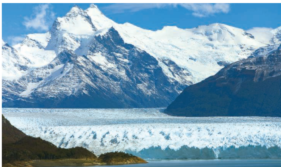
Advance and retreat. According to Ackert et al. , eastern outlet glaciers of the Southern Patagonian Icefield, such as the Perito Moreno Glacier shown here, retreated after the Younger Dryas had ended.

Uncertainties in dating techniques continue to make it difficult to determine whether mid-latitude locations in the Southern Hemisphere experienced Younger Dryas-related climate changes. To illustrate these uncertainties, consider prior studies and that by Ackert et al. , which examine past glacial extents in southern mid-latitude locations. Past glacial extents pro-