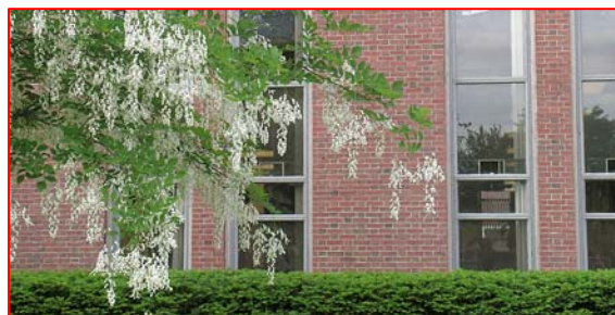
The Dana Biomedical Library

Appendices A and C provide detailed statistics on use of the Biomedical Libraries' services, facilities, and information resources.