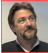
The Biomedical Libraries staff