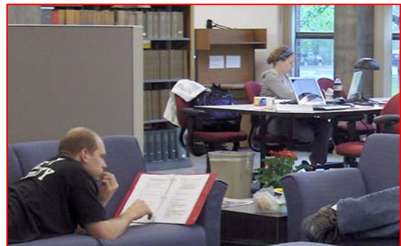
Dana After Renovations

With the joint support of the Medical School and the College Library, $50,000 in improvements to the Dana Library's first floor were completed in August 2006. Unneeded journal shelving was removed, study tables and comfortable furniture (sofas and easy chairs) were added, new computers were installed, and other improvements were made, with a net increase in seats from 197 to 234 throughout the building.