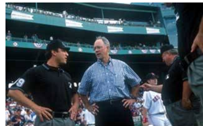
Sandy Alderson meets with umpires on the field at Fenway Park in July 2005

President and part owner of the San Diego Padres, Sandy Alderson ('69) , will present a lecture on Tuesday, April 11th at 3:00 p.m. in the Shapiro room at Tuck.