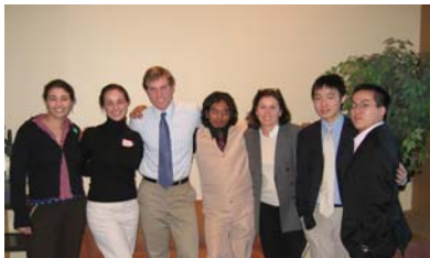
Dartmouth Ethics Society Team Members

For the past three years, Dartmouth students have competed in the Northeast Regional Ethics Bowl. Started in 2004, the regional competition is based on the larger National Ethics Bowl which is hosted by the Association for Applied and Professional Ethics. The purpose of the competition is to develop the moral reasoning skills of undergraduates through a series of debate style presentations. The cases ranged from issues related to eminent domain, vaccinations for attending public school, looting during times of crisis, and academic collaboration.