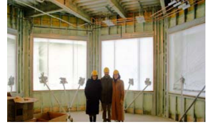
Construction site of future Ethics Institute offices in Haldeman Center

The Ethics Institute staff is eagerly anticipating their move into the new Haldeman Centers Building in the late summer or early fall of 2006. The move to our new spacious home makes it easier to increase programming and provide space for visitors. The library/conference room (pictured at right) will house the Institute's collection of books and videos and the central location of the building will lend itself to easier access for students and faculty.