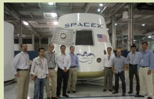
DEN LA's Field Trip to SpaceX in Hawthorne, CA on August 21st