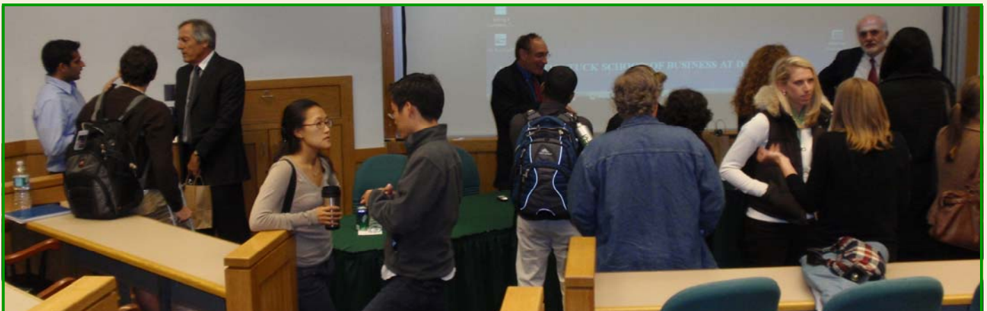
Q & A continued long after the panel ended.

In the end, panelists and audience members alike were in agreement that the opportunity is there and – with health care spending rapidly approaching 20% of the U.S. GDP – the opportunity is sizable.