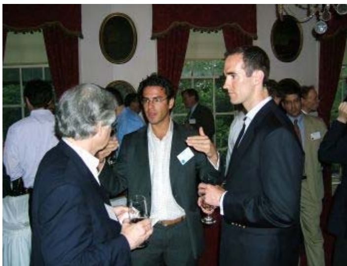
DEN Boston inaugural event at The Union Club in Boston, June 7, 2007

Since the June 7 th event, DEN Boston has officially started a membership campaign and is fostering connections through its new LinkedIn group. The team is also already back to work planning and executing on a series of "tracks" which target their various constituents. The DEN Boston Steering Committee felt that while it is important to get entrepreneurs, VCs, and service providers in the same room, it is also im-