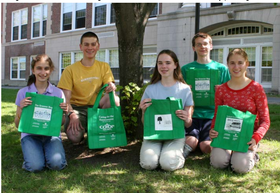
"Kids for a Cooler Planet"