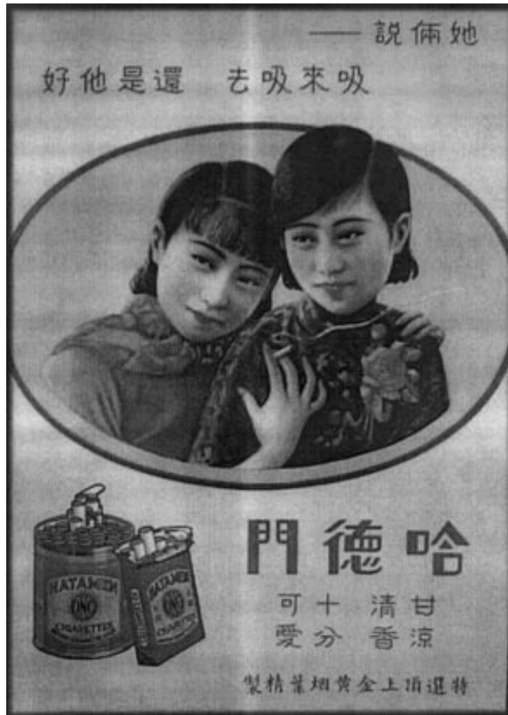
Vintage Chinese cigarette advert