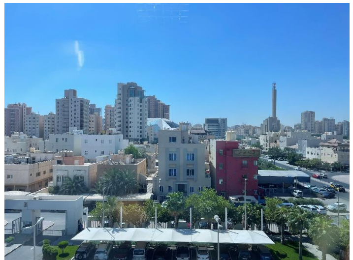
View from AUK

My work with AUK certainly contributed to my professional development. In addition to having the pleasure of diving deep into some of my favorite content areas, sifting through thousands of scholarly materials improved my ability to use targeted key word searches, identify relevant resources, and interpret numerical data. Meeting with my project supervisors weekly also improved my ability to recognize key takeaways and areas for further research. I have definitely noted a strong improvement in my attention to detail, creativity, time