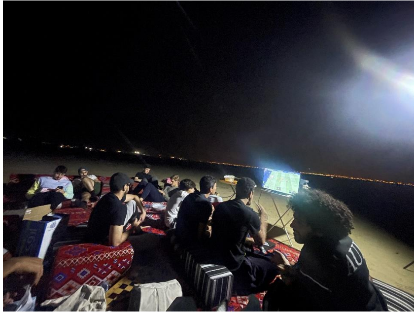
Kashta (desert outing) and FIFA

its cultural and business environment. No matter where I am in the world, a piece of me will always be in Kuwait. I will definitely be back – sooner rather than later inshallah.